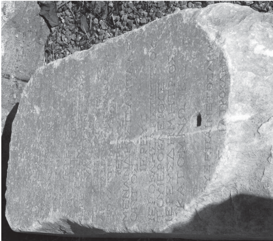
Inscription no. 2