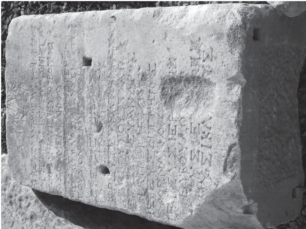
Inscription no. 1