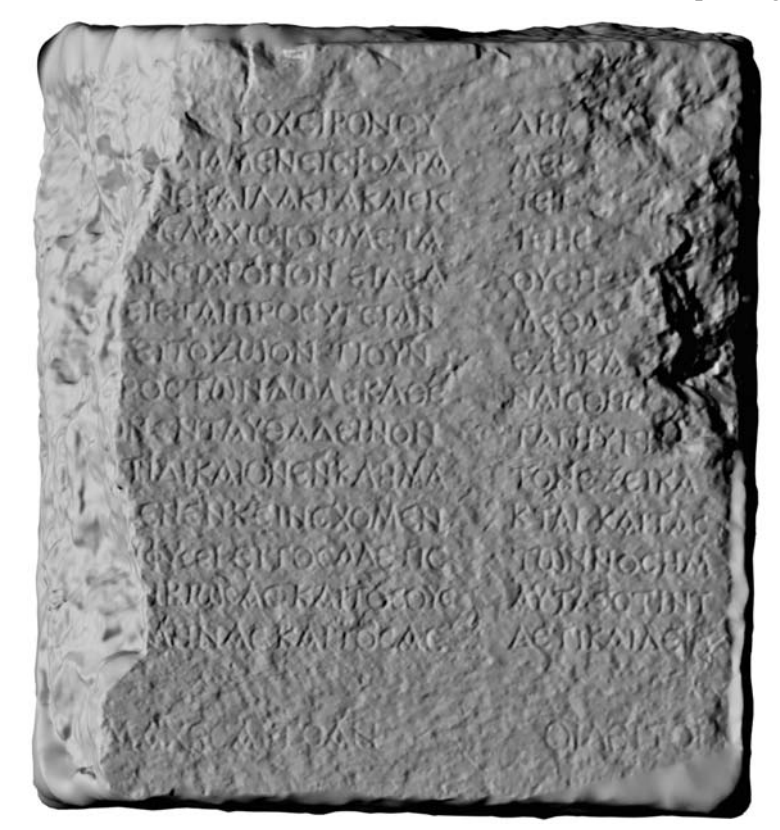
Fig. 3. Fr. 47 III-IV (YF 085)

In this context further observations were made on blocks like fr. 47 III–IV (YF 085). While the top and bottom of line 1 are very straight and regular, the lower lines are less regular and slightly wavy. One has to conclude that the scribe exactly defined the regular horizontal trace of the first lines of the columns while he added the next lines without such a pre-alignment.