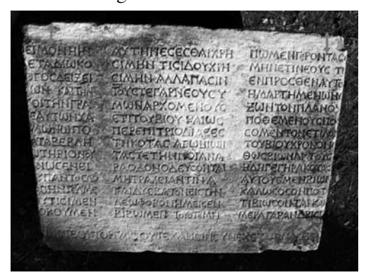
Fig. 2: NF 207 (YF 271)

The different height of blocks, and especially of upper margins within the same course of the Diogenes wall, prompted the tacit assumption in Martin Ferguson Smith's reconstruction that the upper and lower edges of these courses did not exactly line up. An important aim for future investigation of the 3D scans will therefore consist in identifying notches formed by different heights of adjacent blocks (fig. 1) and looking for upper or lower blocks of neighbouring courses with matching features.