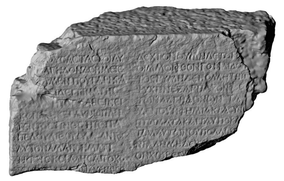
Fig. 4: Fr. 47 I-II (YF 096)

The 3D scans show clearly that the two blocks of the Ethics which were brought together by Martin Ferguson Smith as fr. 47 I–II (YF 096) and III–IV (YF 085)<sup>15</sup> do not fit together.