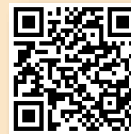
Design: Ulrike Kersting